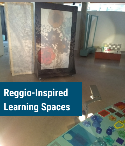
Reggio-Inspired Learning Spaces

Learning communities have formed to support Creative Curriculum/Project Approach, Montessori practices, Tools of the Mind, and Reggio-Inspired practices. Here are just a few of our learning communities in action!