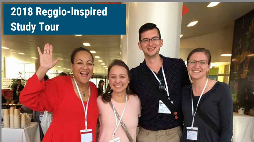
2018 Reggio-Inspired Study Tour