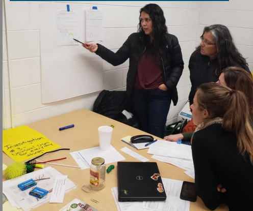
Creative Curriculum and the Project Approach