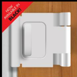
Door Guardian Inswing