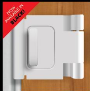
Door Guardian Outswing