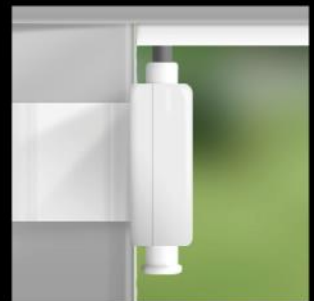
Patio Door Guardian